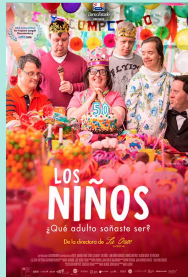
LOS NIÑOS (2016)