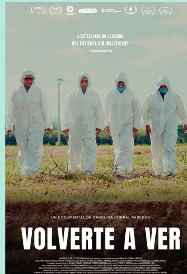
VOLVERTE A VER (2021)