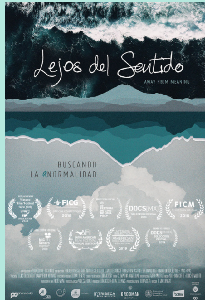
LEJOS DEL SENTIDO (2018)